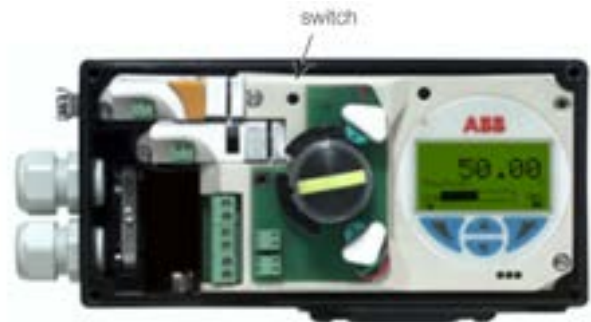
Figure 3: Switch shutdown module

When the shutdown module is used, the switch shown in the figure must be in the "I" position.