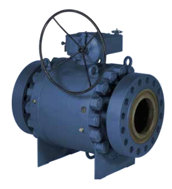
TRUNNION MOUNTED BALL VALVE