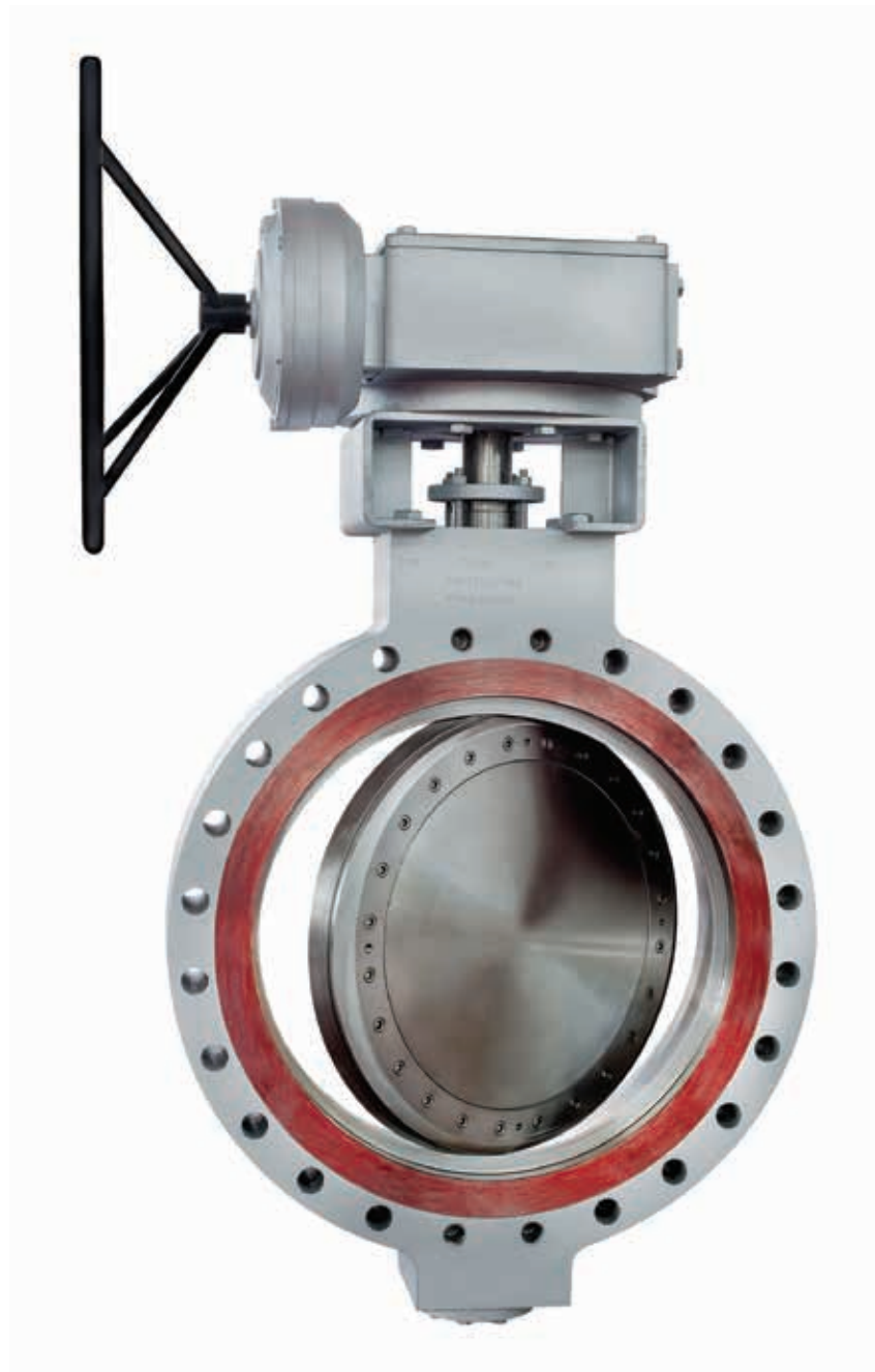
TRIPLE OFFSET VALVE