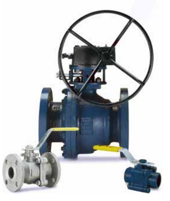
FLOATING DESIGN BALL VALVE