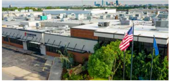
Oklahoma City, OK