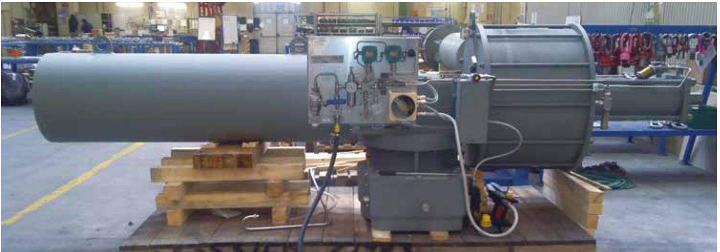
The Cameron LEDEEN® actuator mounted on a DYNATORQUE D-Stop partial-stroke test device.