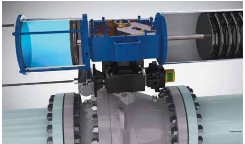
DYNATORQUE D-Stop devices are modular. Specify local key- or remote-operated, with or without optional limit switches, to indicate on-test or off-test.