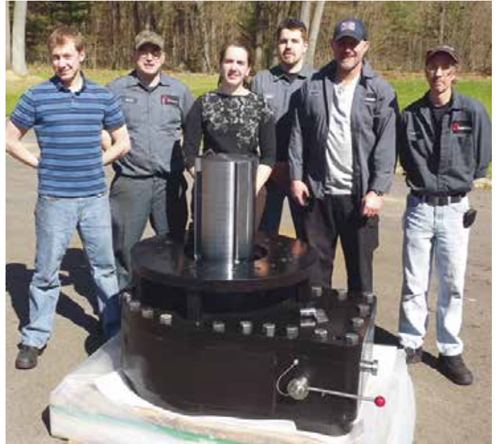
DYNATORQUE D-Stop devices are built for both large and small valves. This DYNATORQUE DT4000 D-Stop device will fit between a large pneumatic actuator and a 36-in, 600-lbm ball valve installed on an offshore platform.

At this point, when the valve actuator is sent to the test position, the drive cam that is attached to the actuator through the drive coupling rotates until it comes into contact with the engagement cam, normally 20° (this is a specifiable value). Metal-to-metal safety prevents the actuator from rotating past the set point.