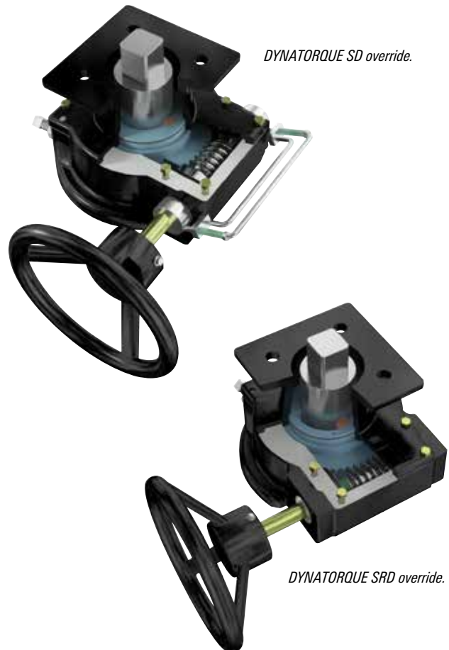
DYNATORQUE SD override.