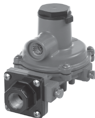
Figure 1. Type R222 Second-Stage Regulator