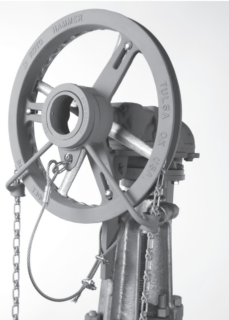
CL24 with RCK 1/4