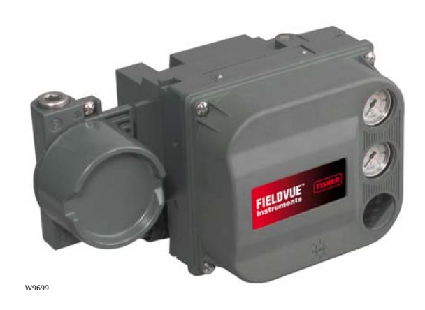
Figure 1. Fisher DVC6200 Digital Valve Controller with Standard Finish