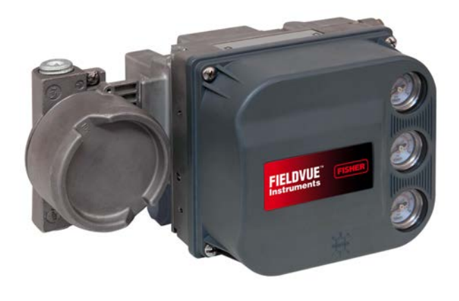
Figure 2. Fisher DVC6200 Digital Valve Controller Stainless Steel Version

As an alternative to painted instruments, the FIELDVUE DVC6200 digital valve controller can be furnished with a stainless steel module base, housing and an all-stainless mounting kit. The sealed terminal box isolates field wiring connections from other areas of the instrument and keeps water and harsh atmosphere away from electronic components. The DVC6200 stainless steel version eliminates all diecast aluminum parts, which greatly increases its resistance to the tough, corrosive environments found on offshore platforms, within chemical plants, and inside refinery processing units.