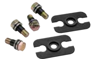
DK1 Dielectric Kit