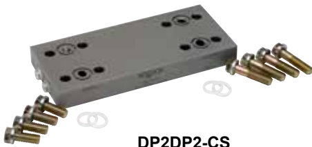
DP2DP2-CS \Delta Pressure to \Delta Pressure Adaptor