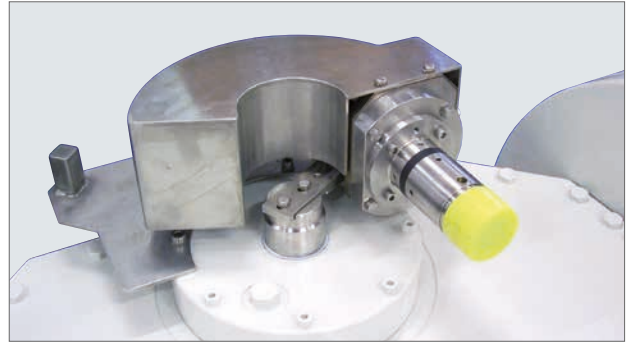
Position transducer assembly with electrical instrumentation connector.