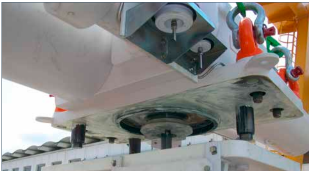
Actuator declutch system.