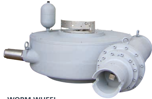
WGS - WORM WHEEL Torque to 1,000,000 Nm