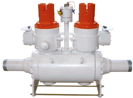
DS - DIRECT GEAR Torque to 19,000 Nm