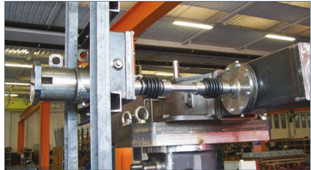
Stainless steel drive extensions for remote location of ISO 13628-8 rotary torque tool receptacle.