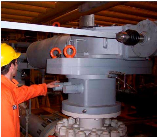
BGS - BEVEL GEAR Torque to 50,000 Nm