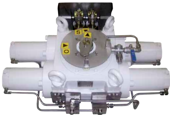
GSR - RACK AND PINION Torque to 5,600,000 Nm