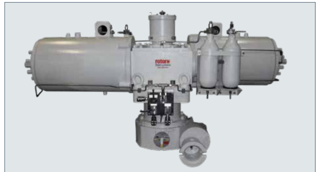
Actuator trimmed for subsea & splashzone.