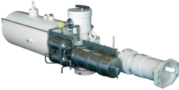
GSH SCOTCH YOKE Torque to 1,300,000 Nm