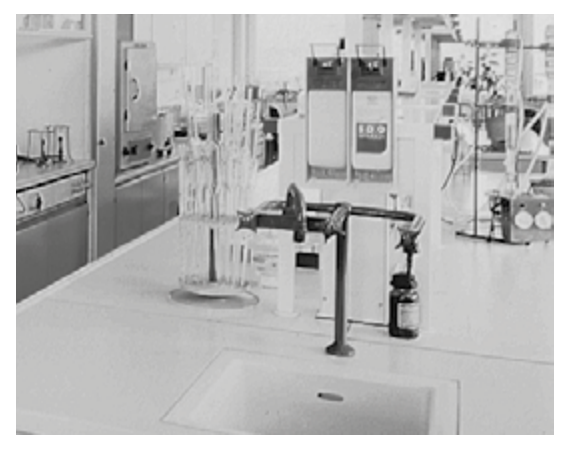
Pressure switch for fan monitoring in laboratories.

The pneumatic and electrical connections are accessible from the same side in order to ensure space-saving installation.