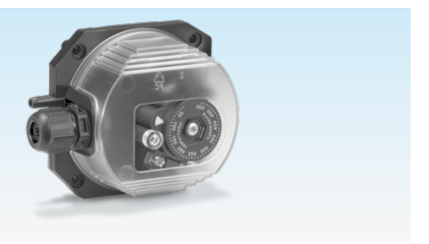
Easy-to-install connections, accessible from one side.

Pressure switches for air CPS can be used as excess pressure, negative pressure and differential pressure switches for air and other non-flammable gases. They monitor extremely slight pressure differences and trigger switch-on, switch-off or switch-over operations if a set value is reached.