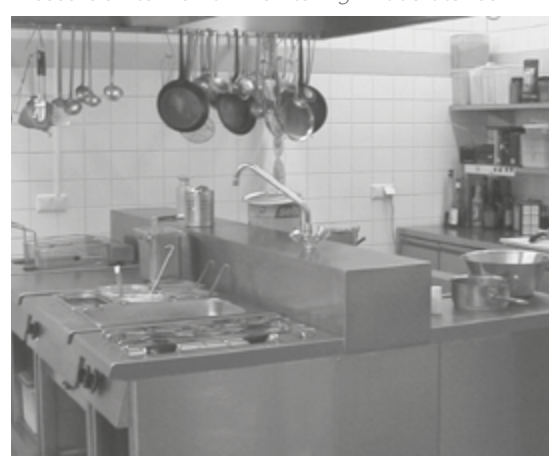
CPS for filter monitoring in kitchens.