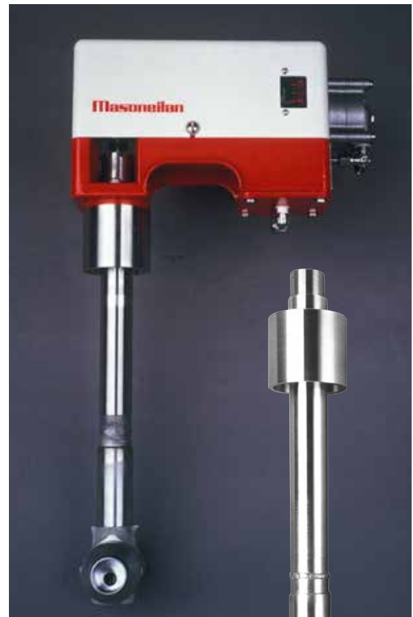
Cryogenic Varipak Control Valve

The design of the plug allows the working parts to be accurately centered in relation to the seat and provides a uniform temperature zone for the guiding.