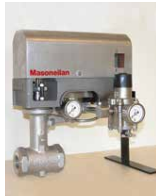
Varipak full Stainless Steel