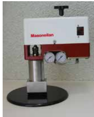
High Pressure Varipak