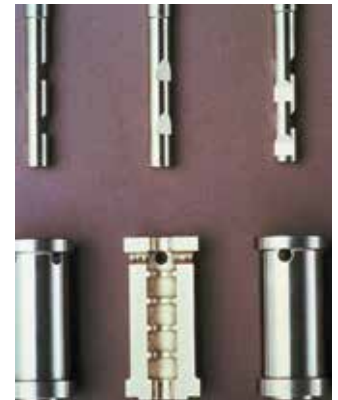
Varilog Trim Subassembly