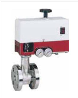
Optional Flanged Varipak Control Valve