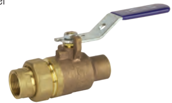
ST-585-70-SU Solder x Threaded