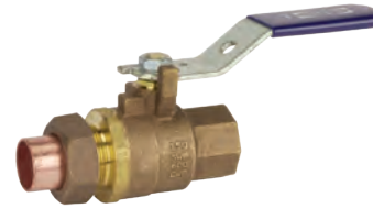
TS-585-70-SU Threaded x Solder