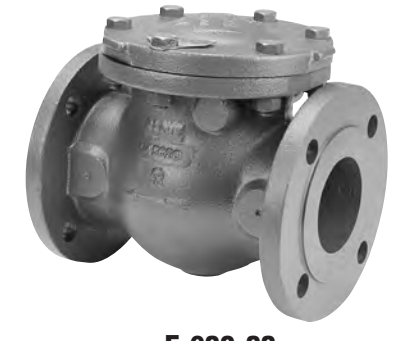
F-938-33 Flanged-Raised Face