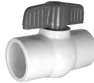
4660-S Socket Weld