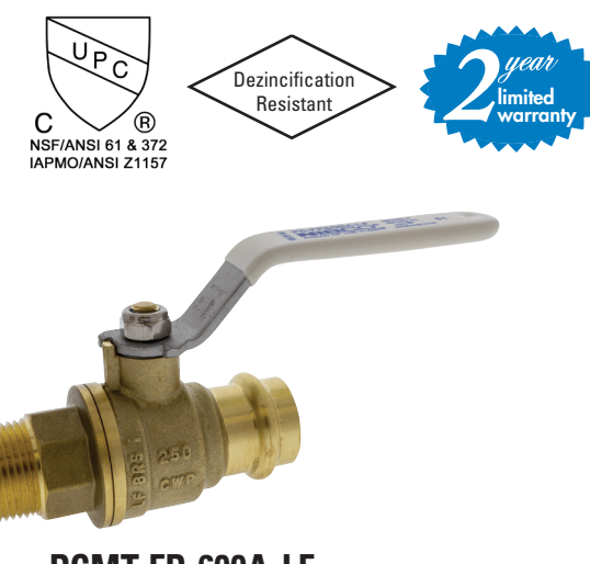
PCMT-FP-600A-LF Press x MIP 1/2" - 1"