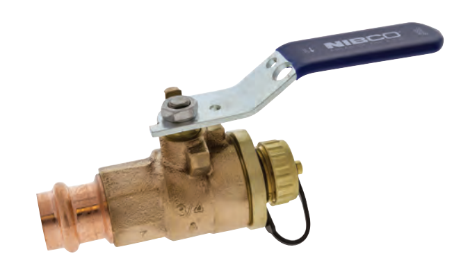
PC-585-70-HC Press Female x Hose End

NIBCO Press System ball valves are designed to meet MSS SP-110 with the exception of the end connection. Ball valves are down-rated from 600 psi CWP to 250 psi CWP to match the NIBCO Press System. Male and female press-to-connect ends are new technology not yet covered in the current edition of this specification.