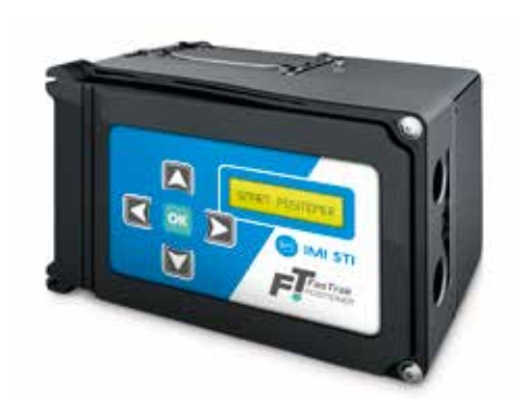
FT display version