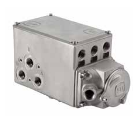
FasTrak is available in stainless steel 316 with explosion proof barrier