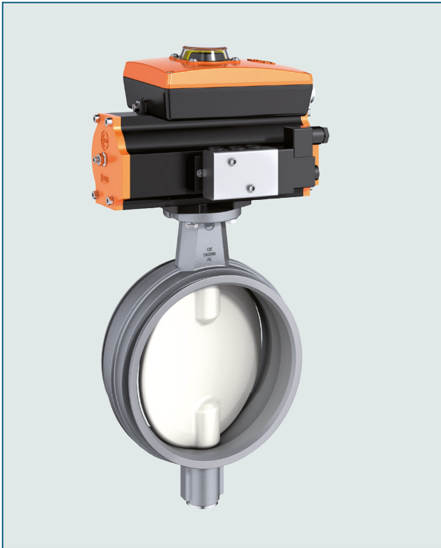
Butterfly valve CK with pneumatic actuator.