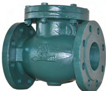
Fig. 5101(PN16/Class 125) 5102(Class 250)