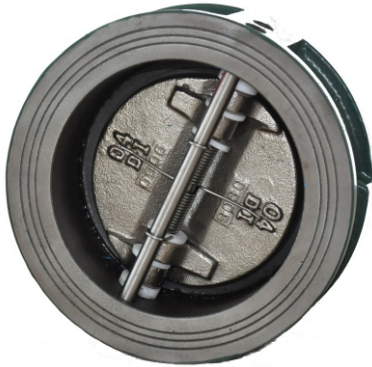
Fig. 5307 (EN-558-1)