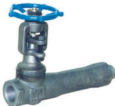
INTEGRALLY-REINFORCED EXTENDED BODY – 2174W

NPS ½–2 (DN 15–50), API 602, ASME CLASSES 800, 1500