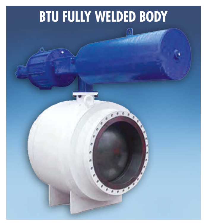
Trunnion ball valve, fully welded body, anti blow-out stem, antistatic device, and fire safe design