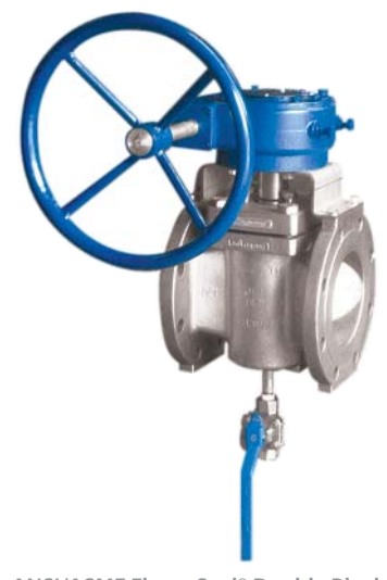
ANSI/ASME FluoroSeal® Double Block and Bleed Plug Valve with Gear